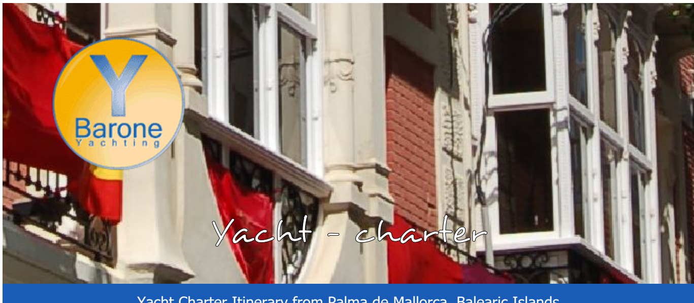
Yacht Charter Itinerary from Palma de Mallorca, Balearic Islands